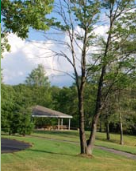
NORTH POINT SHELTER AT BEARTOWN LAKES RESERVATION

Reserve a picnic shelter or lodge in your Geauga Park District for a safe and fun-filled atmosphere that's sure to make your next get-together a success!