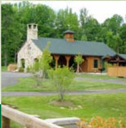
SUNNYBROOK LODGE AT SUNNYBROOK PRESERVE

Reserve a picnic shelter or lodge in your Geauga Park District for a safe and fun-filled atmosphere that's sure to make your next get-together a success!