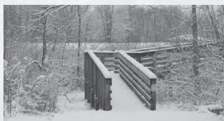
Walter C. Best Wildlife Preserve