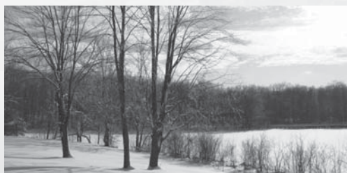
Beartown Lakes Reservation

Thank you to all the volunteers! Geauga Park District truly appreciates your time and hard work.