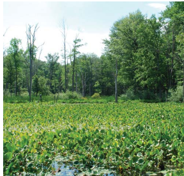
VIEW OF THE WETLANDS FROM THE INTERURBAN TRAIL

Located in an old glacial lake bed, much of the land within The Rookery is wetland. Open marshes and swamp forests are found throughout, enhanced by the work of beavers.