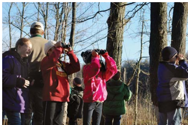
BIRD WATCHING DURING A NATURALIST LED HIKE ALONG THE INTERURBAN TRAIL

To alleviate flooding and drain standing water, much of the Chagrin River was channelized in the late 1960s. In 1968 TRW, Inc. bought more than 1,000 acres intending to build a