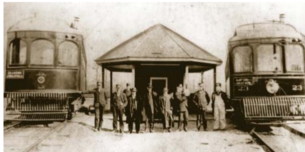
"THE JUNCTION" ON THE INTERURBAN RAILROAD

THE ROOKERY is a 603-acre tract located in southwest Munson Township. The Chagrin River, the Interurban Railroad Junction and one of the largest nesting colonies of Great Blue Herons in the county are all special features of this park. It is Geauga Park District's intent to protect this natural area in perpetuity.